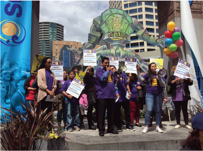
WFF Janitors speak out during the 2017 Justice 4 Janitors March & Rally. The group came together for a safer workplace, affordable healthcare, and a path to pay raises.

Janitors who clean the office buildings at Seattle University just voted YES to joining our union. This group of workers was non-union for over ten years, until they came together this summer and decided to fight for better wages, better healthcare, and a safe workplace.