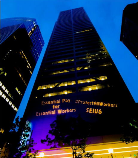
Pictured above: candlelight vigil honoring SEIU6 members who have lost their lives TO COVID-19; janitors standing up for racial justice; downtown building lit up with a call for essential pay. More on Facebook @SEIU6 Property Services NW